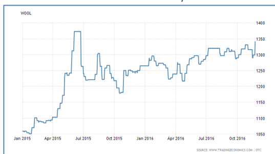
8-month Price History for Wool